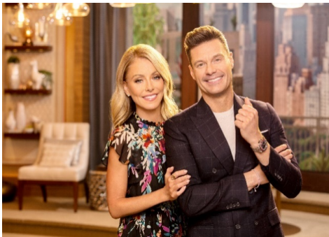
Kelly Ripa and Ryan Seacrest

Viewers Can Win Fantastic Prizes in 6abc's Watch and Win Sweepstakes