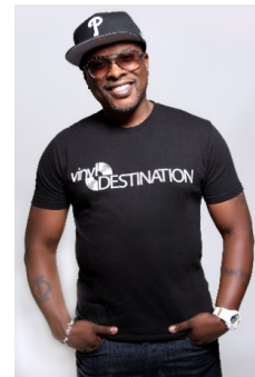
DJ Jazzy Jeff